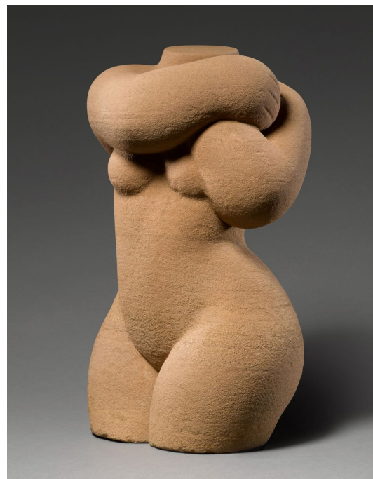
Fig. 2, Frank Dobson, Torso , 1926, carved sandstone, H 41 cm, Private Collection